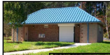
Existing County Facilities at Beatty's Ford