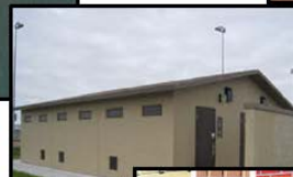
CXT Pomona Building Customizable colors and layout to match existing facilities and suit site needs if site is actively managed*